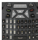
Full alphanumeric Qwerty (S model)