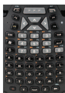
Full alphanumeric ABCDEF (C model)