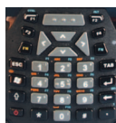
Numeric only (S model)