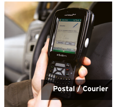
Postal / Courier